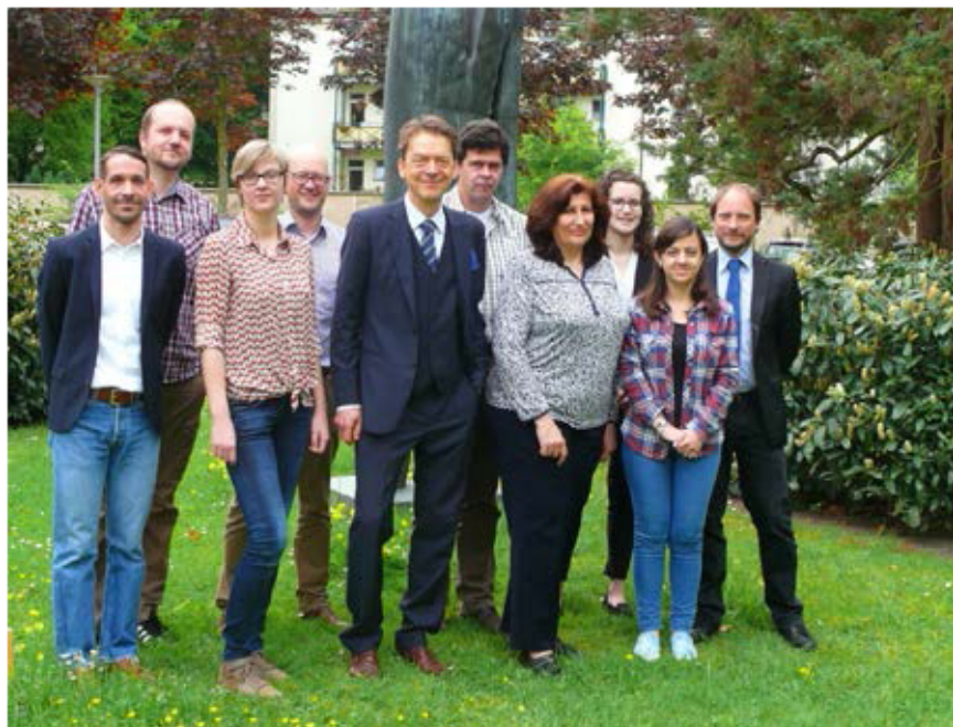
The two guests from the Macedonian State Statistical Office and the colleagues of the Federal Statistical Office