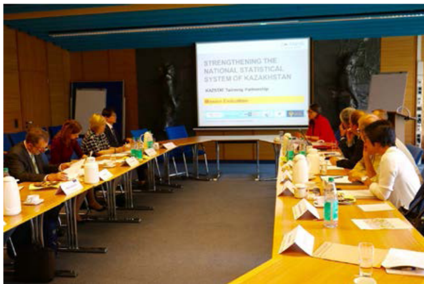
Work session of the consortium meeting