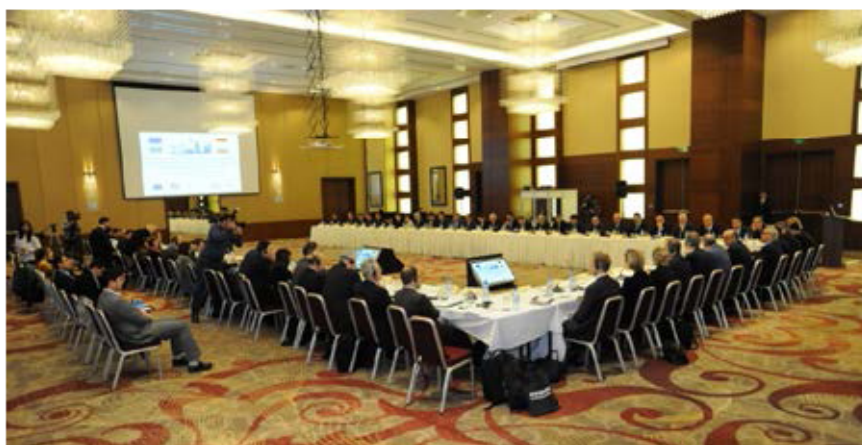
Participants in the kick-off event

The implementation of the twinning project between the Federal Statistical Office and the State Statistical Committee of the Republic of Azerbaijan (SSC) started in October 2015. Activities focus on quality management, geographical information systems, Community statistics on income and living conditions (EU-SILC), statistics of people with disabilities, and tourism statistics.