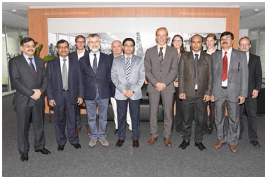
Participants from Bangladesh and from the Federal Statistical Office