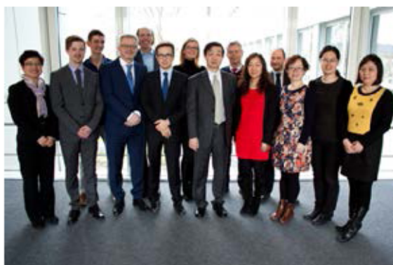
Participants in the study visit on employment statistics in Wiesbaden

In February 2016, the Federal Statistical Office conducted a five-day study visit in the employment statistics subproject in co-operation with Eurostat. The consultations focused on the current developments and quality criteria of monthly data in Germany and on the technical implementation of estimation methods in the labour force survey by means of the SAS data processing software. In addition, the experts of the Federal Statistical Office presented to the guests from the NBS the rearranged sampling design of the German labour force survey and the further development of the system of household statistics in Germany. At Eurostat, the NBS experts were given detailed information on the specific European requirements regarding methods, technologies and quality framework conditions in the context of collecting monthly data for employment statistics at the European level.