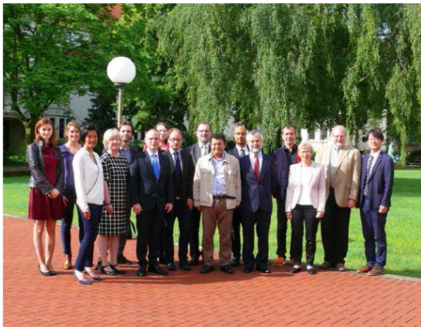
Participants in the second consortium meeting of the KAZSTAT project in Bonn

Another important item was the evaluation of the project activities carried out. This was based on a survey conducted among the involved international experts after they had finished their missions in Astana. Consequently, comprehensive data material from the preceding four years was available for the evaluation. The presentation of the results showed a clearly positive picture. A large majority of the German and international experts were very satisfied with the realisation and the results of their missions. Special mention should be made of the expert level of the Kazakh statisticians, which was rated as "very good" by 71 % of the experts and as "good" by 26 %.