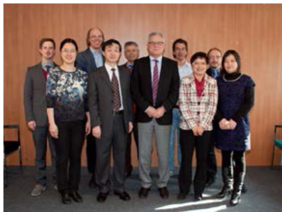
Final meeting of the study visit on employment statistics

In the employment statistics subproject, co-operation activities with the NBS have been performed since 2008 at six-month intervals. The next mission of German experts to China will take place in November 2016. The project is scheduled to end in 2017.