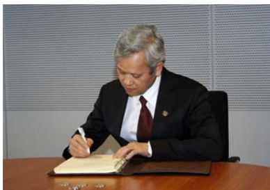
The Director of the General Statistics Office of Viet Nam signing the visitors book