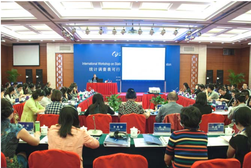
Participants of the “International Workshop on Statistical Questionnaire Testing and Evaluation” in Beijing

Co-operation with the NBS training centre is intended to continue in 2015.