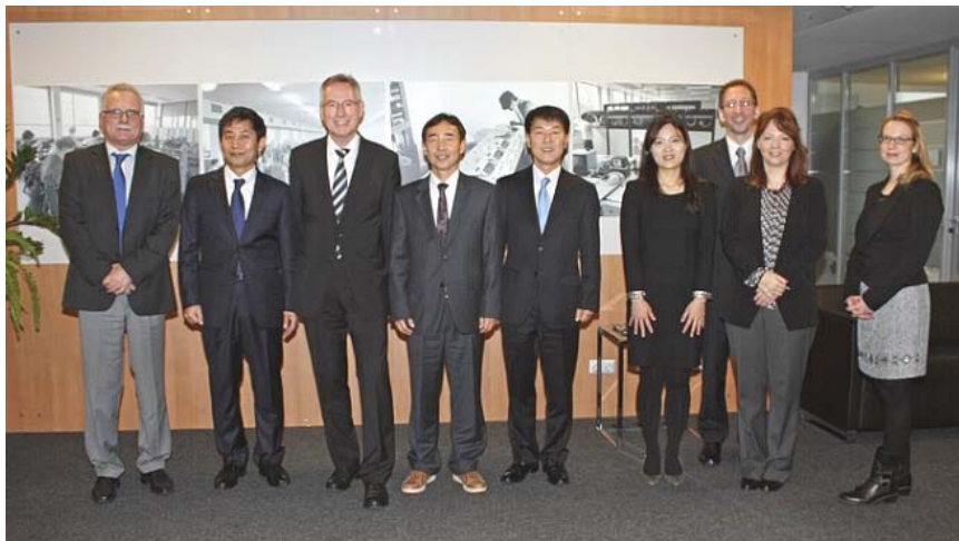
Staff of the Federal Statistical Office with the Korean guests