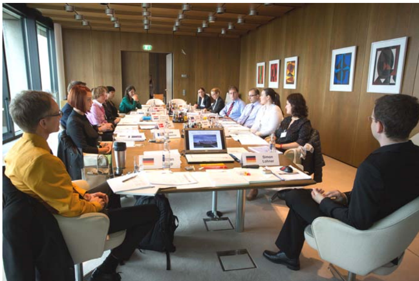
Participants during the seminar