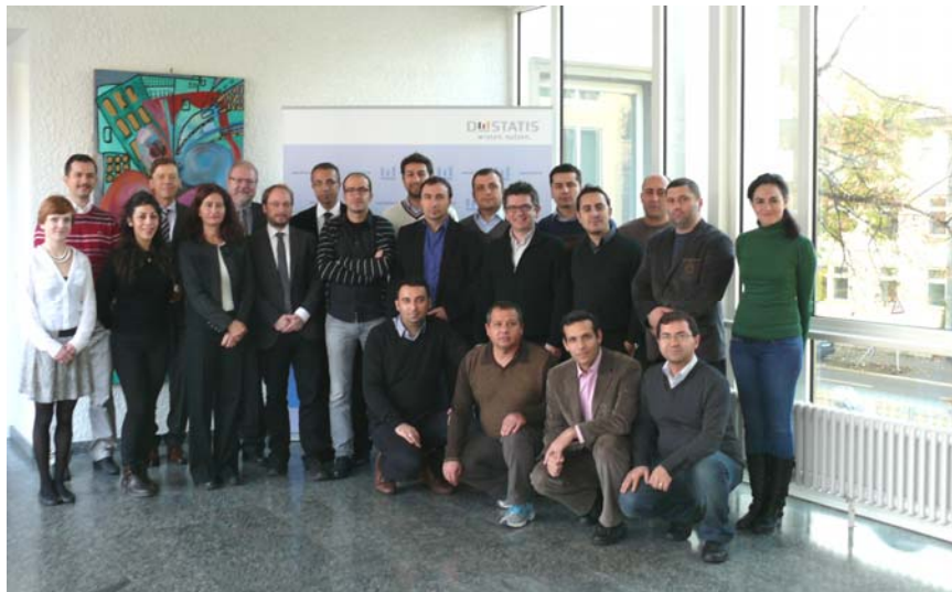
Participants in the TQM seminar in the Bonn Branch Office

This seminar of the Federal Statistical Office is a product which focuses on both managing statistical processes and assuring data quality in official statistics. It can be readily customised to the needs of interested statistical institutions. As statistical results have to meet continuously increasing accuracy and relevance requirements in a globalised information society, well trained and qualified staff are indispensable for statistical offices to meet the increasing data requirements.