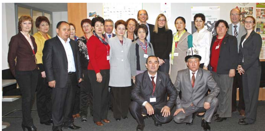
Delegation from Kyrgyzstan with staff members of the Federal Statistical Office

During their stay in Germany, the delegation also visited the head office of the Federal Employment Agency in Nuremberg. The purpose of the study visit was to make a contribution to improving labour market services in Kyrgyzstan and to initiate processes of change. The guests were accompanied by representatives of the Deutsche Gesellschaft für Internationale Zusammenarbeit (GIZ) that is currently engaged in a vocational training and employment promotion programme in Kyrgyzstan.