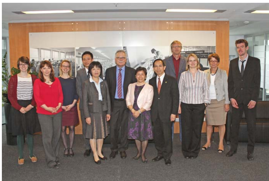
Delegation from Taiwan with representatives of the Federal Statistical Office

The delegations received information about the Federal Statistical Office, the system of official statistics in Germany and co-operation between the Federal Statistical Office and Eurostat. In addition, the agenda covered topics such as geographical information systems, life tables and industrial statistics. Other issues discussed included short-term economic indicators, the production index and seasonal adjustment procedures.