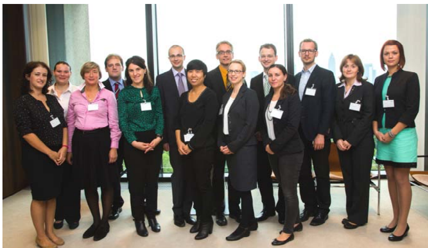
Participants of the ESTP “Balance of Payments – Advanced course”

It was based on the introductory course of Paris and, as a pilot seminar, held for the first time.