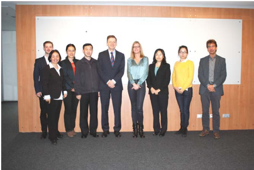
Experts on employment statistics at the Federal Statistical Office