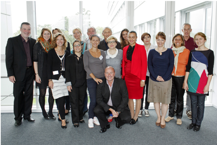
Participants of the ESTP course “Train the Trainers”

For the seventh time already, the Federal Statistical Office hosted the ESTP course “Presentation, facilitation and consultation skills for statistical trainers” or briefly “Train the Trainers” in Wiesbaden. 13 participants from seven statistical institutes of the EU and Turkey attended the seminar. The course held in English was to teach them presentation techniques and improve their didactic skills, thus enabling them to impart specialist knowledge on a highly professional level to international audiences.