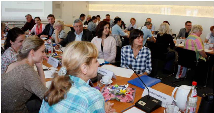
Delegation from Belarus