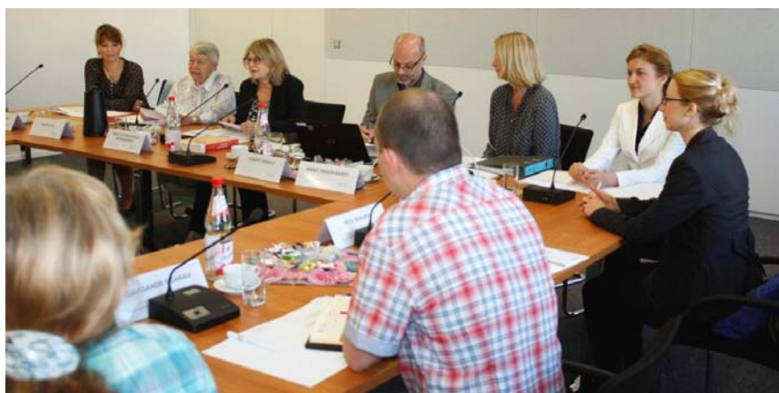
Representatives of the Federal Statistical Office

During their stay in Germany, the delegation from Belarus also visited the Construction Cost Information Centre of German Chambers of Architects, the Baden-Württemberg Chamber of Architects, the Land Office of Construction and Transport of Thüringen in Erfurt, and a medium-sized construction firm.