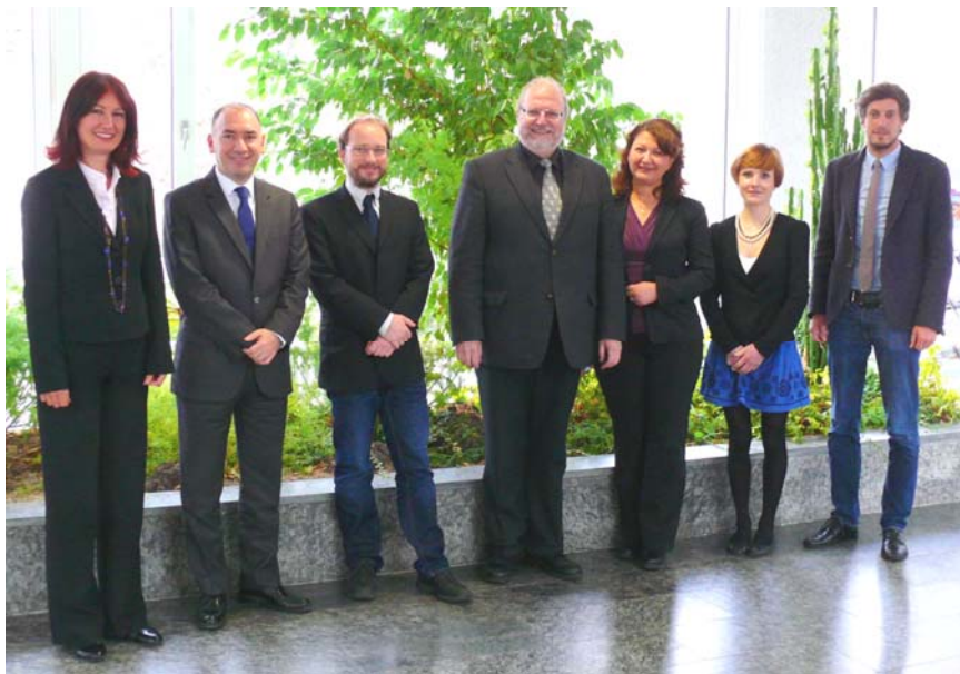
Experts of the International Co-operation unit during a study visit in Bonn

The EU provided a training grant for each of the project phases, which the Turkish Statistical Institute used mainly to finance study visits to other countries. The Federal Statistical Office organised a high number of such study visits to Germany.