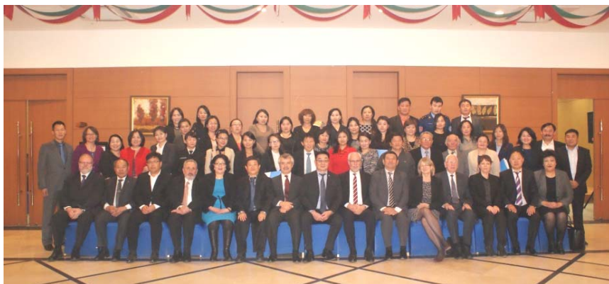
Participants at the closing conference in Ulan Bator

In view of their positive experience with the long-term co-operation in the World Bank project, the two parties agreed to consider a continuation of the twinning project as bilateral co-operation from 2015.