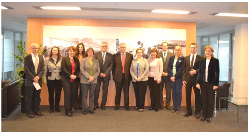
Staff of the Federal Statistical Office together with the Russian guests and interpreters from the Federal Ministry of Finance and the Federal Ministry of the Interior

Furthermore competent staff of the Federal Statistical Office took this meeting as an opportunity to present the pretest laboratory to the visitors.