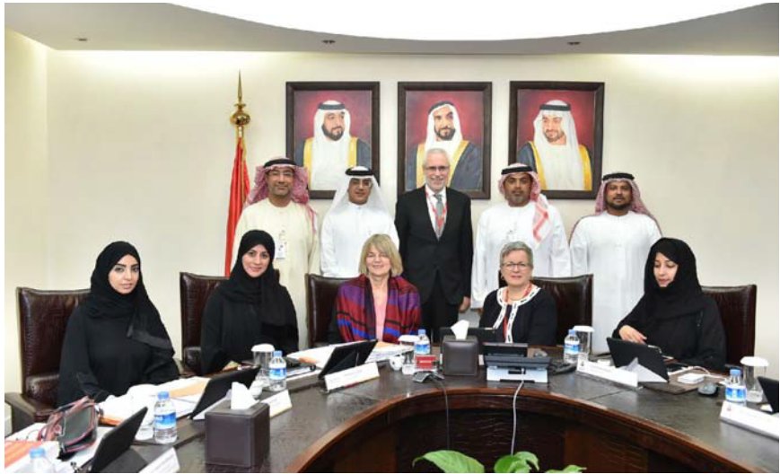
Representatives of the Federal Statistical Office at the Statistics Centre of Abu Dhabi (SCAD)