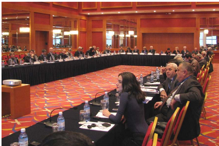
Second day of the Visibility Conference at the Park Inn Hotel in Baku, 11 November 2011

The conference's first day focused on the detailed presentation of project results and discussions on each of the four project components. It was held at the premises of SSC for nearly 60 participants from various state bodies, member state (MS) short-term experts and SSC staff. For the official part (second day), high-level representatives of the line ministries, ambassadors of the participating countries and main users of statistical information were brought together. The project achievements, results and experiences were presented and highlighted by the top management and representatives of the State Statistical Committee of the Republic of Azerbaijan and the Statistical Offices of Germany, Bulgaria, Czech Republic and Lithuania. Moreover, the experience gained during the project's implementation was shared; follow-up activities and assurance of sustainability of the results were discussed. Like that, the conference drew increased attention to the partner's institutions and statistical data users, highlighting on the improvements resulting from the project. The participants were provided with information material including a CD with key project documents.