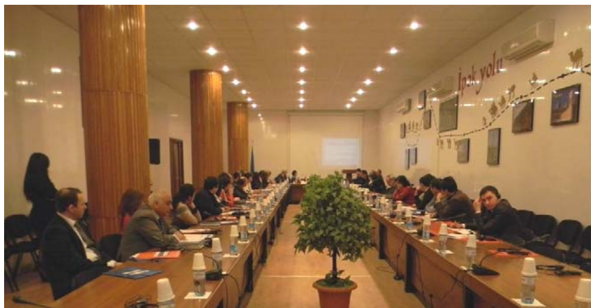
First day of the Visibility Conference at the SSC, 10 November 2011

Since November 2009, the Federal Statistical Office and the State Statistical Committee (SSC) of the Republic of Azerbaijan have closely co-operated under a joint Twinning project. The co-operation is funded by the European Union. Other project participants are the National Statistical Institute of Bulgaria as junior partner and the statistical offices of the Czech Republic and Lithuania. The project deals with the enhancement of statistical methods applied in national accounts, in measuring the non-observed economy, business statistics and price statistics.