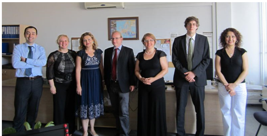
TurkStat and Destatis representatives at the planning meeting in Ankara

The long-term co-operation between the Federal Statistical Office and TurkStat, the Turkish statistical office, was discussed at a meeting between representatives of the two offices in July 2011. Staff members of the organisational units responsible for international co-operation in the two offices exchanged experience from previous projects, especially the EU-funded programmes on Upgrading the Statistical System of Turkey (USST). Through service contracts and training grants from EU funding instruments, in the projects USST I and II, Destatis has contributed since 2002 to developing the Turkish system of official statistics. Also, the two offices discussed current co-operation activities and presented their work in international statistical co-operation.