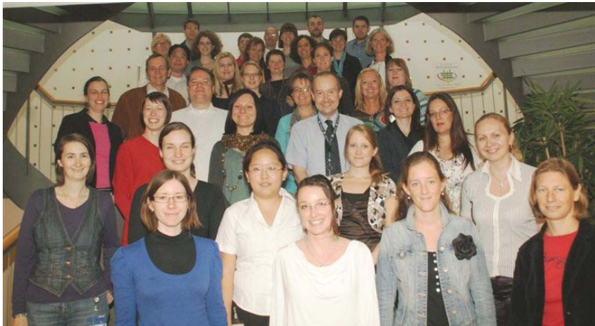
Participants in the Eurostat study week in May 2011

As I work in the National ESTP Contact Point at Destatis, I applied to get to know the Eurostat unit A3 “Strategic planning; learning and development”. It is responsible for implementing and developing the ESTP at the European level. In my daily work, I had already been in contact with the colleagues at the Eurostat working level.