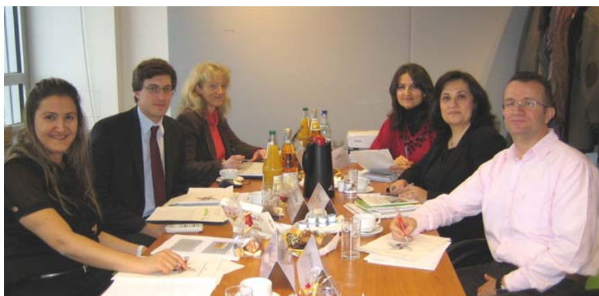
German and Turkish experts at work

At the end of the year, Turkish statisticians paid a study visit to Destatis in Wiesbaden on the issue of training. From 19 to 21 December 2011, three staff members of the TurkStat training centre visited Destatis to exchange views with Destatis representatives on the theory and practice of shaping different training approaches.