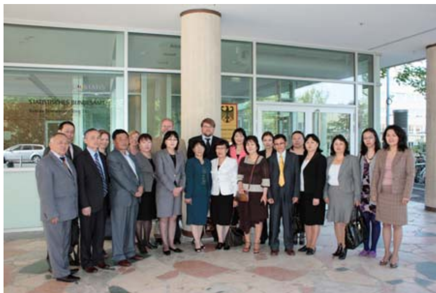
17 representatives of Mongolian regional statistical offices together with Destatis staff

A highlight during the first six months was the study visit by a group of 17 heads of Mongolian regional statistical offices to Germany from 23 to 27 May 2011. The guests visited the Federal Statistical Office in Wiesbaden and Berlin, the Hessian Land Statistical Office and also the Office for Statistics of Berlin-Brandenburg. The visit was designed to give the participants a better insight into the organisational structure of official statistics in Germany, in particular with respect to the functions of the statistical offices of the Länder.