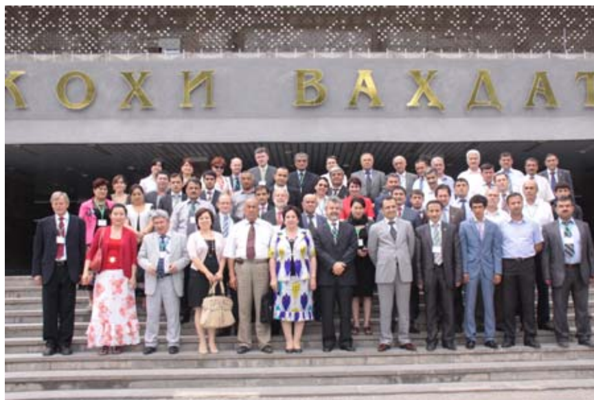
Final conference participants in front of the Kohi Vahdat event hall

To improve user orientation, the Tajik statistical office conducted a user survey whose results were integrated into the daily work. The public relations work of the Tajik statistical office was also improved considerably by introducing a corporate design for publications and by redesigning the website.