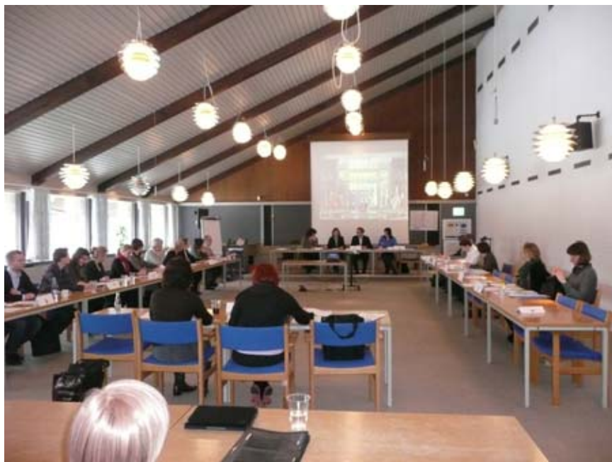
Work session of the ESTP training course on active participation at EU meetings held in Slangerup/Denmark

as well as their methods and challenges of work. Many exercises gave us the chance to get to know the other colleagues and to profit from their various levels of experience in the field of committee work.