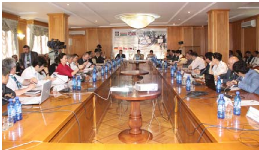
Participants of the Conference

On 18 May 2011, representatives of the Tajik statistical office and the Federal Statistical Office presented the results of the World Bank project on Strengthening the National Statistical System at a final conference in Dushanbe/Tajikistan. The Twinning partners, representatives of the Tajik government and the World Bank, and the independent project evaluator agreed in their positive assessment of the project results. With a budget amounting to 3.1 million US dollars, more than 140 consultations and training activities were carried out in five years under the leadership of the Federal Statistical Office. The statistical institutes of Denmark, Sweden, Slovakia and the Czech Republic also participated in the transfer of knowledge. On the whole, the Tajik partners were advised and trained by 80 German and international experts on more than 1,000 workdays.