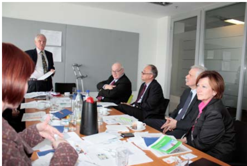
Members of the Croatian delegation engaged in a conversation with a member of staff of the Federal Statistical Office

Due to the eruption of the Icelandic Eyjafjallajökull volcano in March 2010, a long-planned study visit had to be postponed at short notice. The visit to the Federal Statistical Office in Wiesbaden then took place on 14 April 2011. The Croatian delegation, which comprised high-ranking representatives of business and industry, the media and institutions of higher education, was accompanied by a member of the Konrad-Adenauer-Stiftung. After the Croatian delegation was briefly introduced to the system of German official statistics, the data survey of economic trends in Germany was presented. As it seems possible for Croatia to join the European Union in 2013, the participants were especially interested in having another consultation on harmonising economic statistics next year.