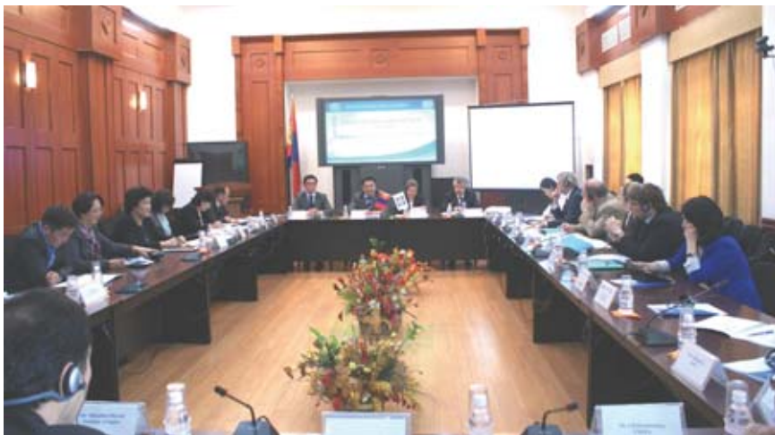
Participants in the conference at the Mongolian statistical office in Ulan Bator on 11 June 2012

Thanks to the active participation of many experts in the World Bank Twinning Project on Strengthening the National Statistical System of Mongolia, the first 18 months have been highly successful. This is confirmed by the result of the first official World Bank mid-term review, which also acknowledges that the experts employed by Destatis achieve very high consultation quality in missions and study visits.