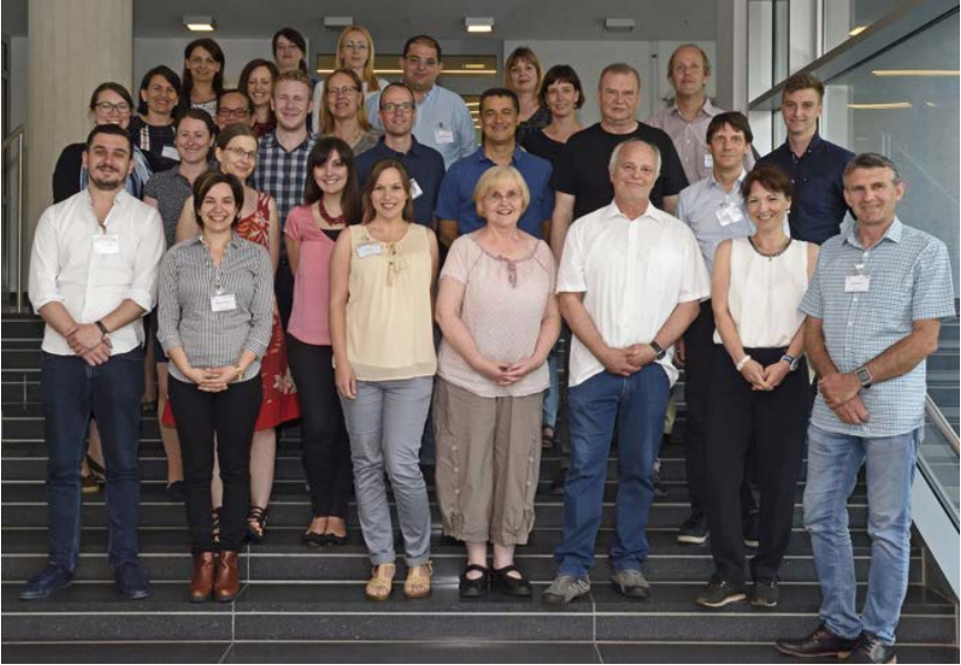
Participants in the ESTP course