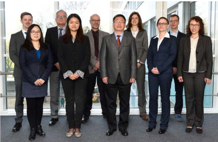
Chinese delegation with Destatis staff during the study visit on price statistics

In the project year 2017, the Federal Statistical Office and the Chinese NBS began to implement the latest co-operation agreement signed last year. Kick-off activities were carried out in the two newly agreed subprojects of bilateral co-operation: residential property price statistics and construction statistics. Furthermore, the exchange of views and experience in the area of employment statistics was completed.