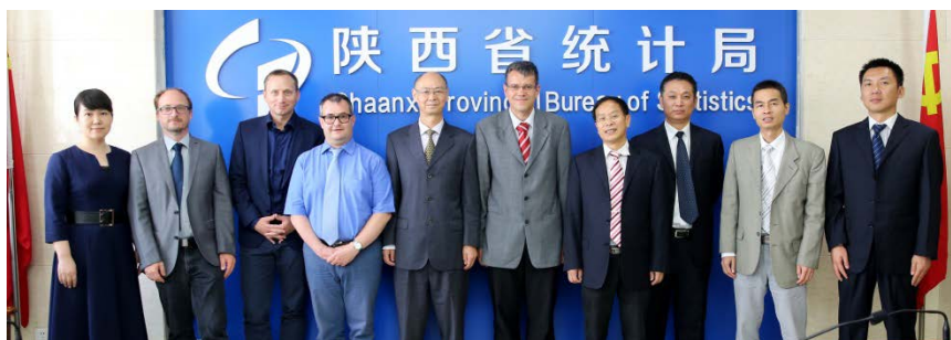
Destatis staff during the expert mission on construction statistics at the Chinese NBS

The final exchange of experience and views on employment statistics between the Federal Statistical Office and the NBS took place in May 2017. Consultations in this area had been carried out since 2009. During the visit, the Chinese participants presented the NBS labour force survey which had been redesigned with German assistance. The efficiency of the consultations is reflected especially by a significant improvement of the quality of the Chinese data collected. The results were for instance used as a basis for public statements by the current Premier of the People's Republic of China, Li Keqiang.