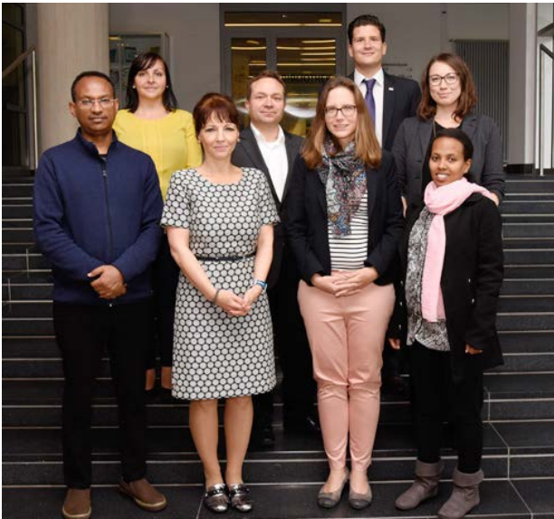
Delegation from Ethiopia with GIZ, Destatis and Statistics Hessen staff

The Federal Statistical Office and GIZ have been working together since the Federal Statistical Office began to provide international consulting services on an institutionalised basis in the 1990s. Intensified co-operation is the result of the growing importance of statistical data for measuring the achievement of goals of the United Nations 2030 Agenda for Sustainable Development.