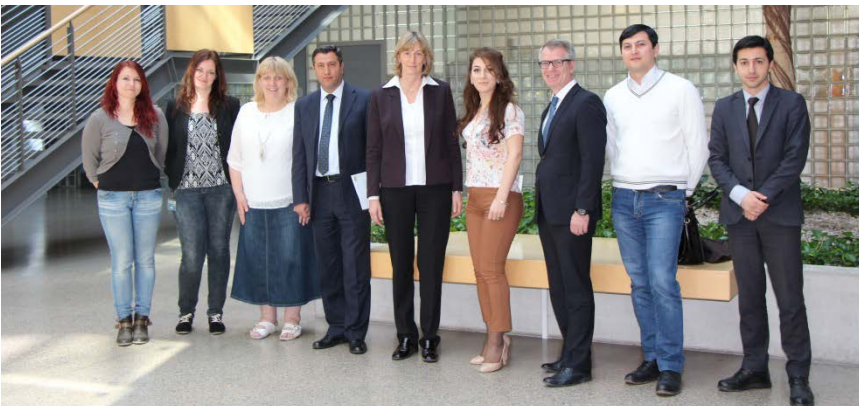
Study visit on tourism statistics to the Bavarian Land Office for Statistics in Schweinfurt

The end of the last consulting activity in Baku was celebrated with a cake. The conclusion of the consultations on geographical information systems coincided with the successful completion of all the planned consultation activities that were organised between the Federal Statistical Office and the State Statistical Committee of the Republic of Azerbaijan (SSC) in their joint twinning project. In close consultation with all parties involved the implementation period was extended by one month until November 2017 in order to provide the project partners with the time needed to implement the follow-up processes and organise the official end of the project. In addition to the Federal Statistical Office, major partners in project implementation were the National Statistical Institute of Bulgaria (NSI) and Statistics Netherlands (CBS).