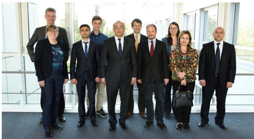
Study visit on quality management in Wiesbaden

The following consulting activities have been carried out since March 2017: