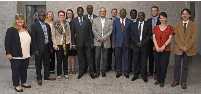
Delegation from Cameroon with GIZ and Destatis staff