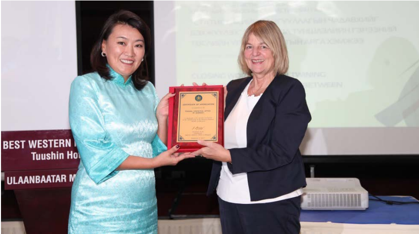
Award given to the Federal Statistical Office