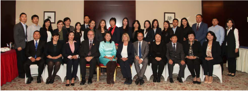
Participants in the closing workshop

In the discussion during the closing workshop, the Mongolian participants stressed that the results achieved and recommendations given by experts were helpful for the further development of Mongolian statistics towards a modern information provider. The representative of the project-implementing unit of the Mongolian Cabinet Secretariat stated that the Smart Government Project's best and most sustainable results were achieved in the statistics component.