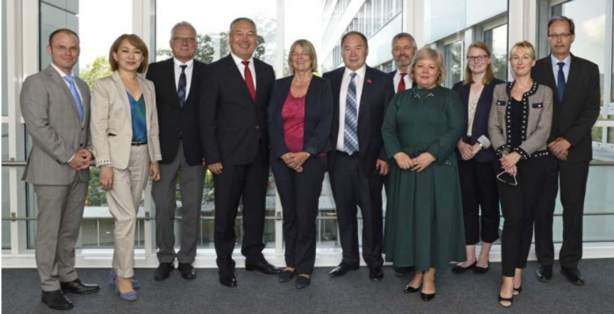
Kyrgyz delegation with representatives of the Federal Statistical Office

The United Nations 2030 Agenda plays an important role in the project. To develop a national sustainability strategy along the lines of the Agenda, the Kyrgyz government has set up a separate committee chaired by the country's Prime Minister. In co-operation with other donors like GIZ, UN and Statistics Norway, KGSTAT project will support this initiative during the whole project period.