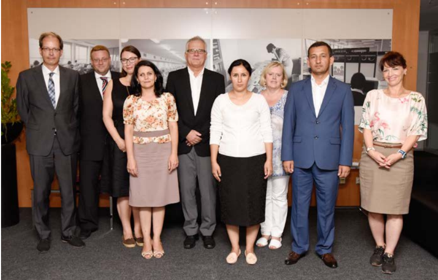
Tajik visitors with Destatis staff