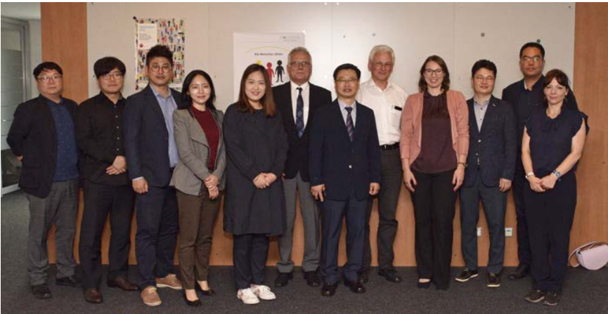
Delegation from the Republic of Korea with staff members of the Federal Statistical Office

The study visit focused on current developments in federal statistics such as using administrative data for statistical purposes, which was explained on the basis of the relevant new provisions in the Federal Statistics Act. Furthermore future-oriented research topics – like the analysis of satellite and telecommunication data – were of great interest to the visitors. Other topics discussed included the European Statistics Code of Practice and quality as a central characteristic feature of official statistics.