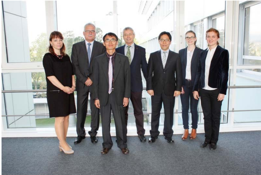
The visitors from Statistics Korea with interpreter and Destatis staff