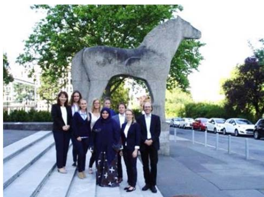
Trainees from the Statistics Centre of Abu Dhabi with Destatis representatives