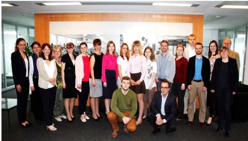
Staff of the Federal Statistical Office with young professionals from the Russian Federation

Furthermore, the Federal Statistical Office organised a study visit on production index calculations for representatives of the Statistics Service of the Russian Federation and the Irkutsk and Arkhangelsk regional statistical services in April 2015.