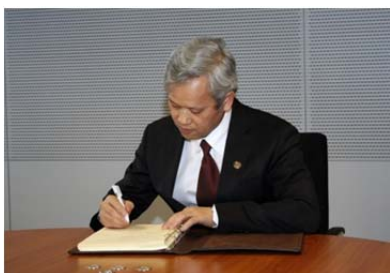
The Director of the General Statistics Office of Viet Nam signing the visitors book