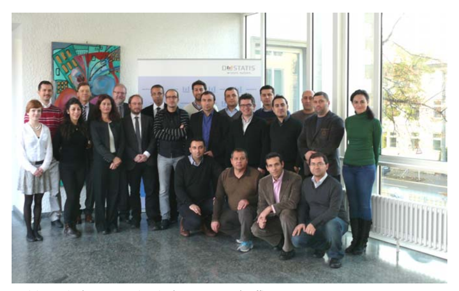
Participants in the TQM seminar in the Bonn Branch Office

This seminar of the Federal Statistical Office is a product which focuses on both managing statistical processes and assuring data quality in official statistics. It can be readily customised to the needs of interested statistical institutions. As statistical results have to meet continuously increasing accuracy and relevance requirements in a globalised information society, well trained and qualified staff are indispensable for statistical offices to meet the increasing data requirements.