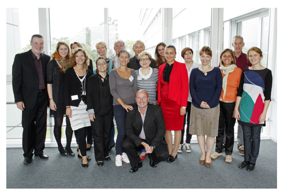
Participants of the ESTP course "Train the Trainers"

For the seventh time already, the Federal Statistical Office hosted the ESTP course "Presentation, facilitation and consultation skills for statistical trainers" or briefly "Train the Trainers" in Wiesbaden. 13 participants from seven statistical institutes of the EU and Turkey attended the seminar. The course held in English was to teach them presentation techniques and improve their didactic skills, thus enabling them to impart specialist knowledge on a highly professional level to international audiences.