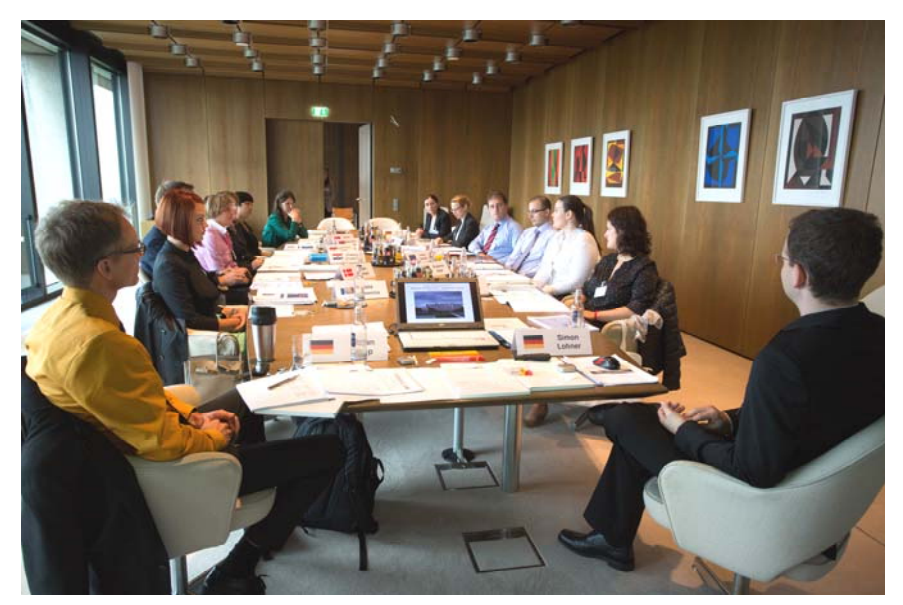
Participants during the seminar