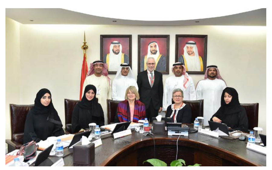
Representatives of the Federal Statistical Office at the Statistics Centre of Abu Dhabi (SCAD)