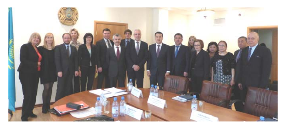
Group photo of the HLPM participants in Astana